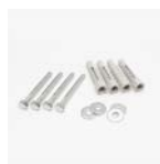
Wall fixing kit