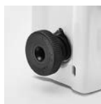
Adjustable rear foot